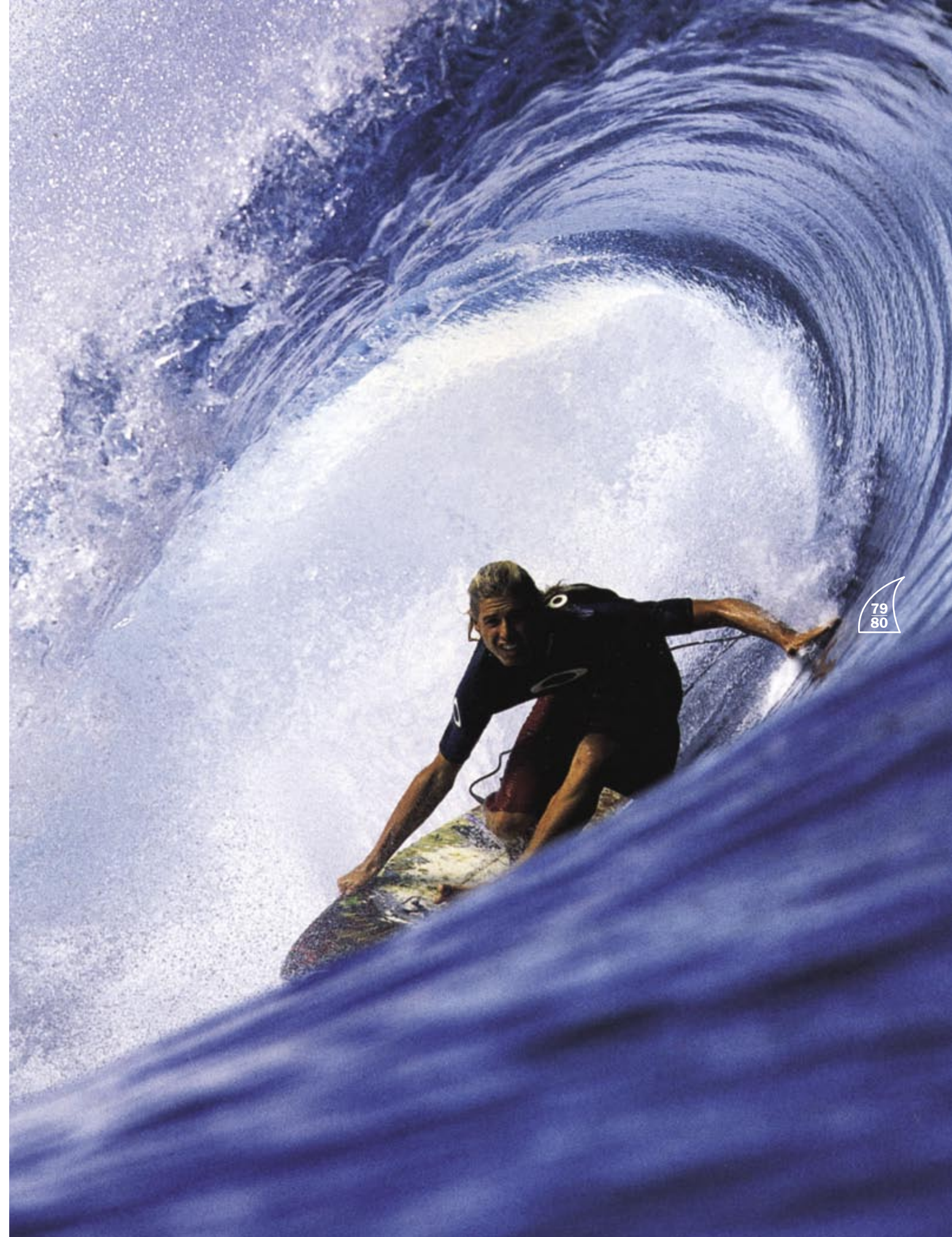
Makua setting for the $66,000 wave at Peahi, November 2002

Probably yesterday. Backdoor. I took off on a nice sized wave. As I was going down my board went to the side and I missed my whole board as I was dropping in. I went to curl up into a little ball just in case I hit the reef, but the lip landed on my shoulders and piledrived my knee straight into the reef, and jammed my hip and smashed it in and knocked all the